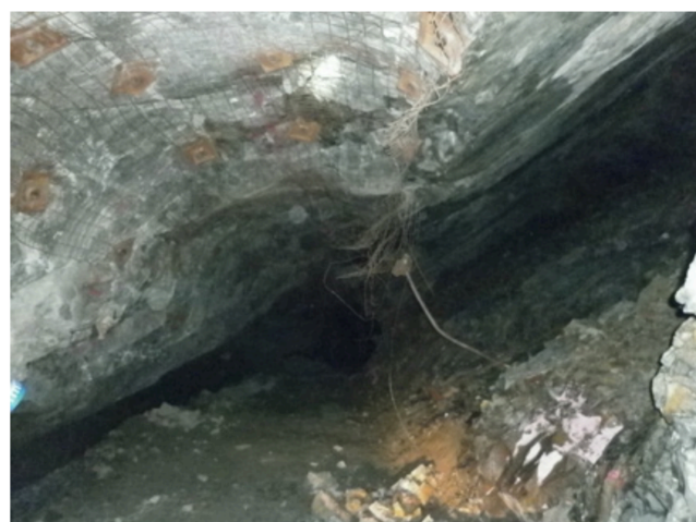
ABOVE: A mined area from Citigold's test mining showing the floor of the level drive, and the stope voids (ore extracted area) above and below the level. The ore has been cleanly extracted, showing how the mining method minimizes dilution by maintaining a narrow stoping 'slot' width.