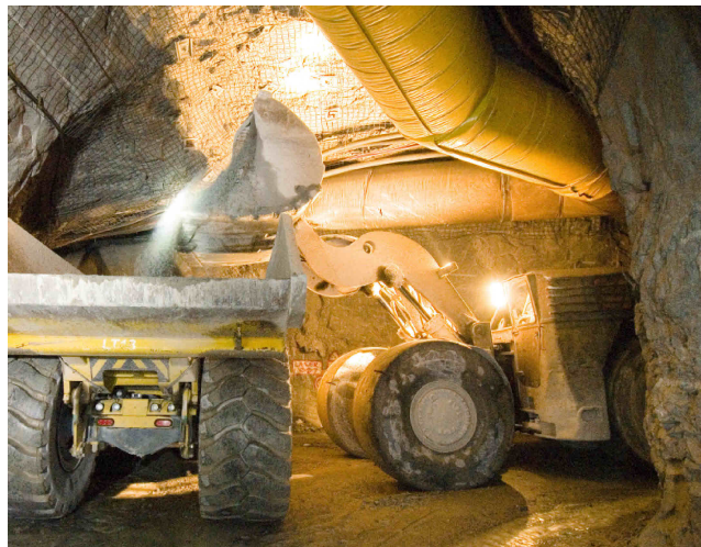
ABOVE: Underground during test mining loading rock into truck for haulage to the surface. This was at the 'Imperial mine, located about 5 kilometres from 'Central'. Future mining will be at 'Central' where there are many more reefs.

The Company is seeking to raise the required capital funding to complete the underground capital works. The business plan and capital expenditure program shows the gold production to commence within 12 months of the injection of the required capital.